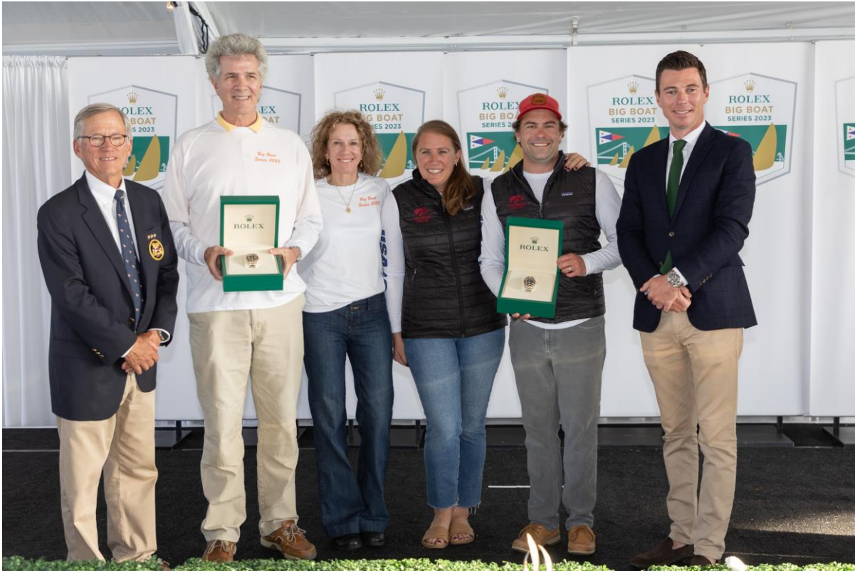
Perpetual Trophies and practical items (vases and watches) were awarded.