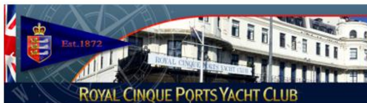
Port of Dover Community Regatta - Saturday 8th August 2022 Stall Holders Application Form