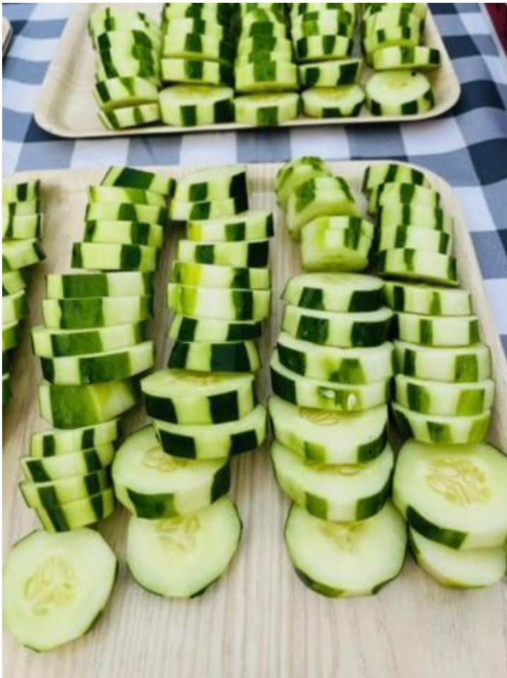
We sourced fresh vegetables from Iron Ox Farm in Hamilton, MA.