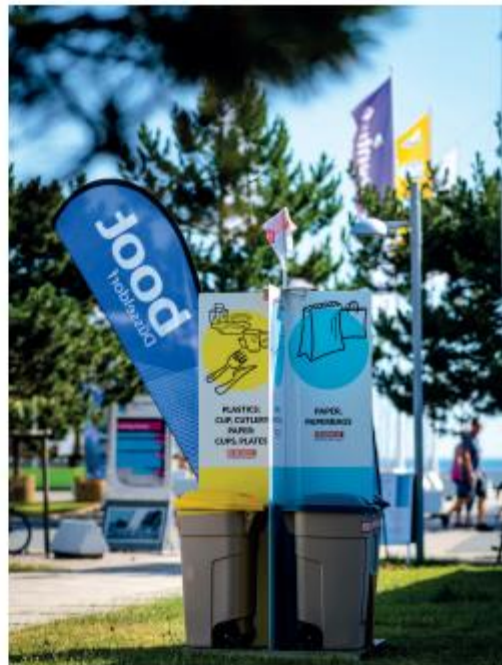
Waste separation will be emphasised in a particularly striking way during Kiel Week.

With the goal of being climate-neutral on balance, Kiel Week meets a requirement of the entire state of Schleswig-