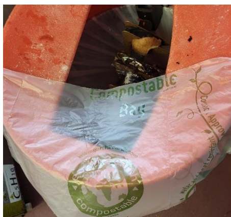
Kitchen food waste management