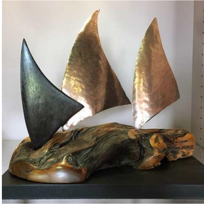
The event perpetual made from bog oak