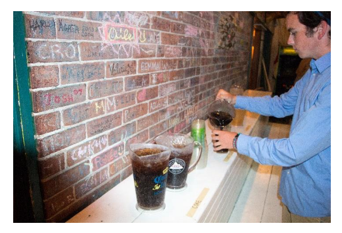
Breakfast at Fishers Island School