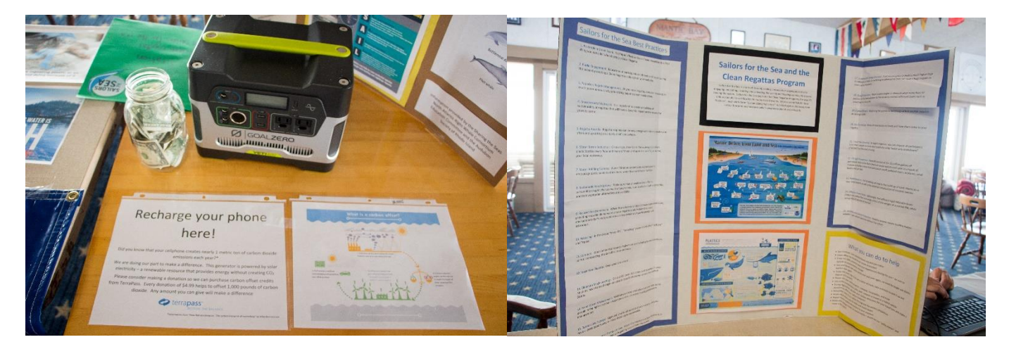
Social Media Outreach and Wildlife Education

Information about energy usage and carbon offsets