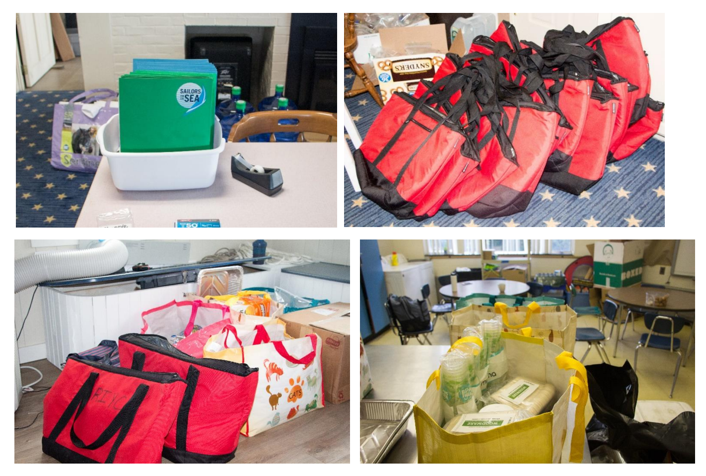
14/15. Good Waste Management and Responsible Signage

Reusable bags (or no bags at all) were used while shopping for the event. There was a concerted effort to avoid distributing papers to competitors – communications were available electronically. Reusable folders were provided to coaches which included only necessary paperwork. Lunch bags for competitors were all biodegradable and were distributed to coaches in reusable thermal bags.