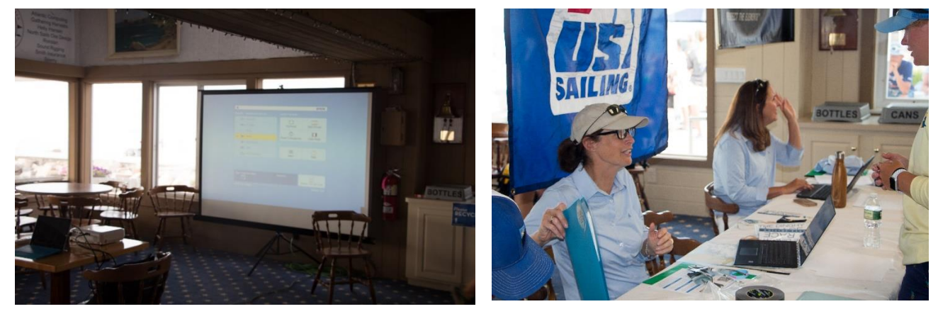
TracTrac, Facebook, and Instagram were utilized to provide live coverage of the event

On facebook: @mudratzracing and @thedinghyrace On Instagram: @ratzracing and @thedinghyrace TracTrac: <u>http://www.tractrac.com/web/event-page/event_20180711_TheDinghyR/1359/</u>